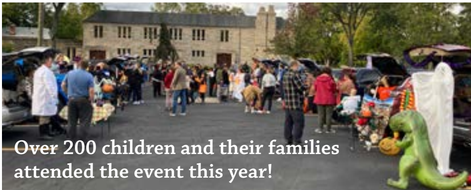
Over 200 children and their families attended the event this year!