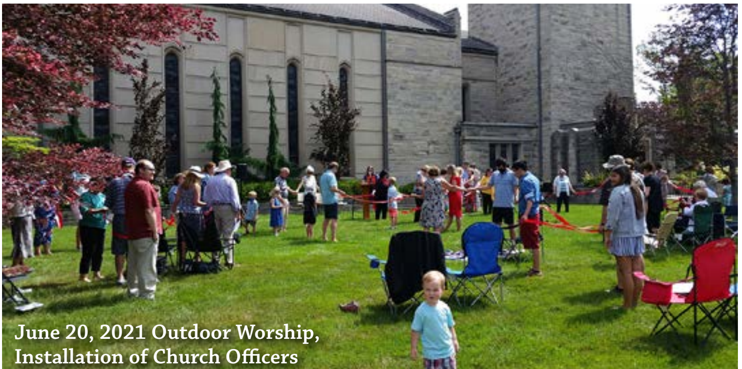
June 20, 2021 Outdoor Worship, Installation of Church Officers

Opening doors, assisting visitors, providing bulletins or other information about our church is very much appreciated by everyone. Plus, serving as an usher only adds a few minutes to your Sunday morning worship time. Sign up today!